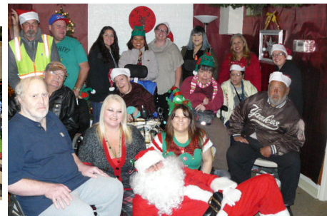
LSF Central Coast Adult Services Staff